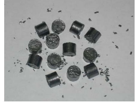
Additional packing is available in kits of 13 pellets for maintenance of installed expansion joints.

Anchor Base: ASME A36 steel plate. Grafoil is a UCAR registered trademark.